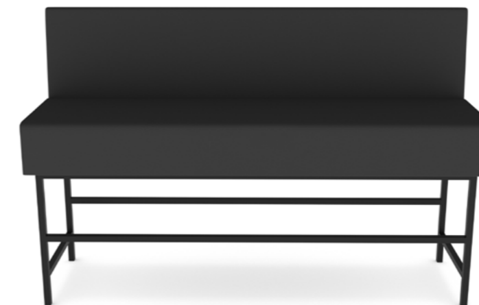
Base metallo a sezione quadrata Square metal base