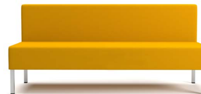
Gamba metallo a sezione quadrata Square metal leg